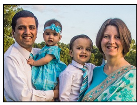
The Devkota Family