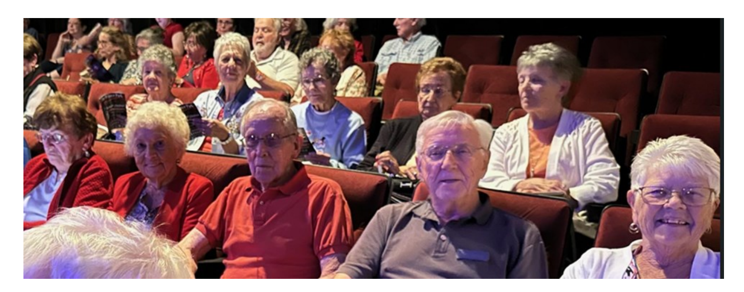
Bravo! Bravo! Everyone loved the music and the performers. It was a sleepy, but happy group riding back to TGO.

If you are single, and you would like to receive information about upcoming Singulars events, please send your name, phone number and email address to pboltonky51@gmail.com and you will be added to the Singulars' Roster.