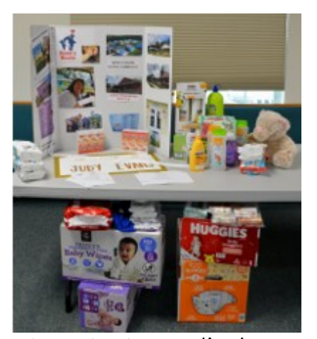
Nana's House display. (Monthly Donations accepted.)