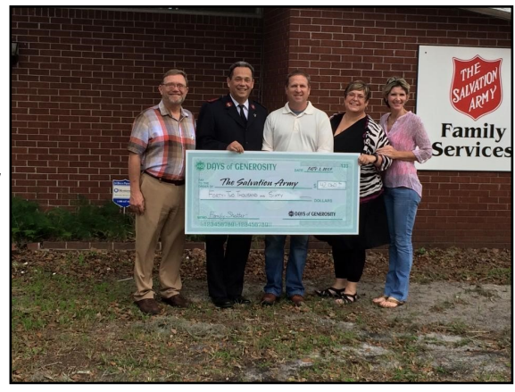
40 Days of Generosity presents a check for $42,060 to the Salvation Army for Family Shelter

"The shelter is completely funded and the Splash Park is well under way with other fund raising events planned to help complete necessary funding," said