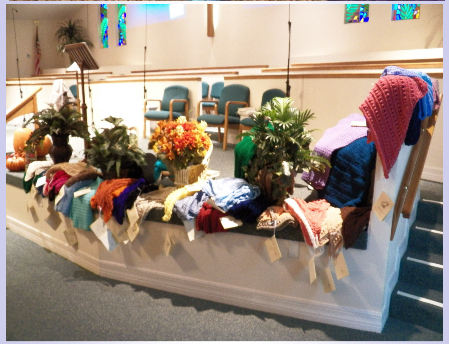
Blessing of the Prayer Shawls - November 9, 2014

The Prayer Shawl Ministry meets on the 2nd and 4th Friday of each month at 9:00 AM in the church narthex. All are welcome to come and create shawls. Donations of 3 skeins (of the same dye lot) of yarn are always welcome for us to turn into a Prayer Shawl.