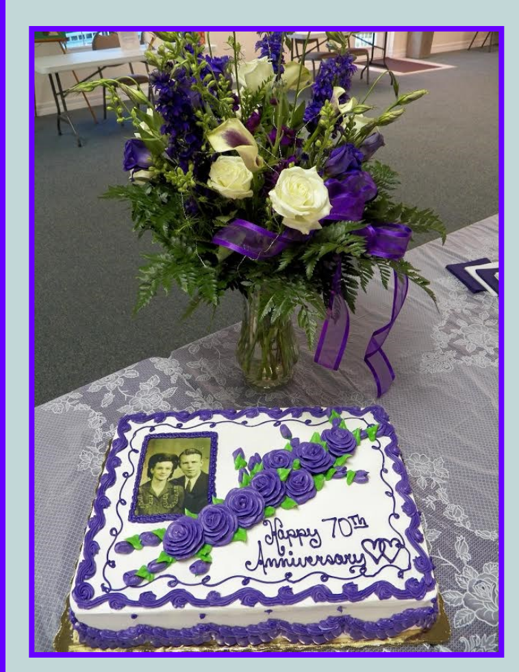
Wow! What a beautiful 70th Anniversary cake. May the Lord bless them with many more years together.