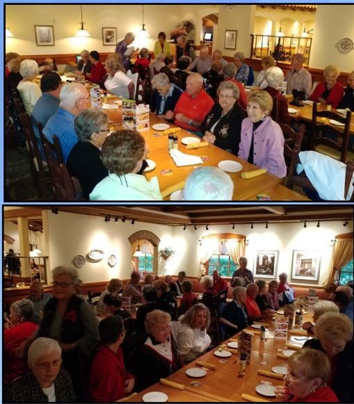
Dinner at Olive Garden — on the way