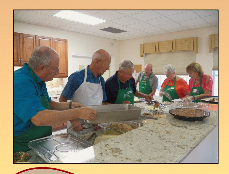
Thanksgiving Dinner At The Great Outdoors Community Church November 23rd