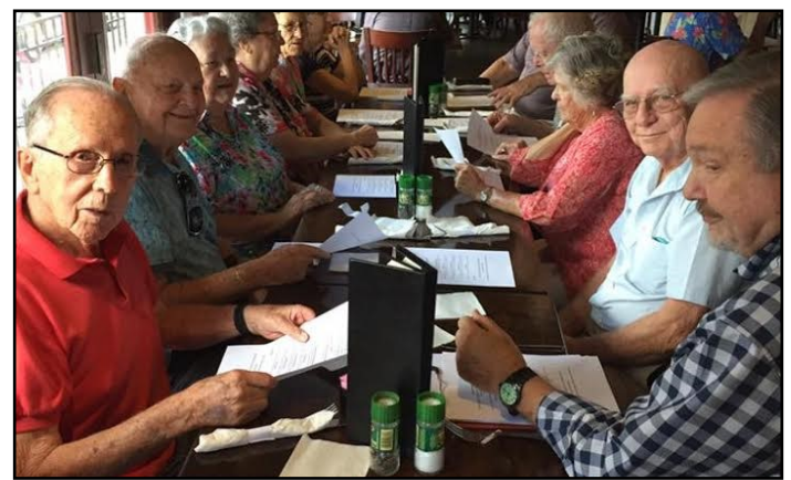
GOCC Singles were able to dine at one long table at Dexter's of Winter Park before leaving for the show at the Playhouse.