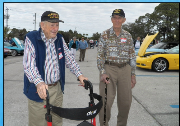
WWII Vets strolling through memory Lane