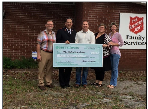
40 Days of Generosity presents a check for $42,060 to the Salvation Army for Family Shelter