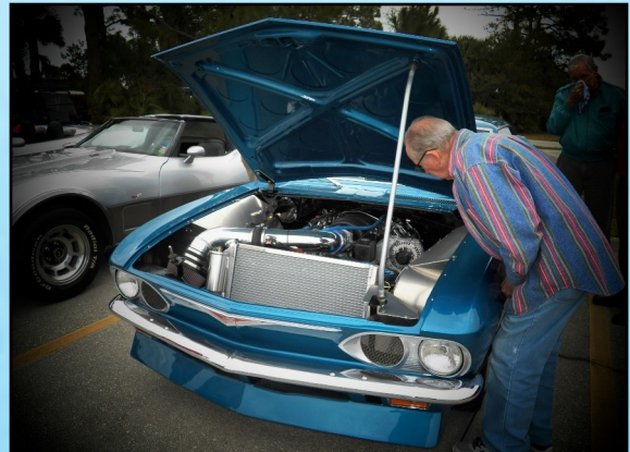
Cam Pelletier checkin' under the hood