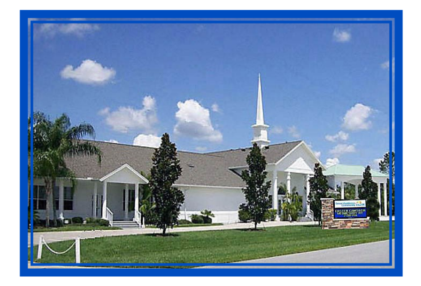
DO YOU LOVE YOUR CHURCH?

Now that is an interesting title for an article in the Messenger. We all love our church and support it in many ways. We attend and give our tithes and offerings. We give of our time and talents. There are many ways that we give and support the works of the Great Out-doors Community Church.