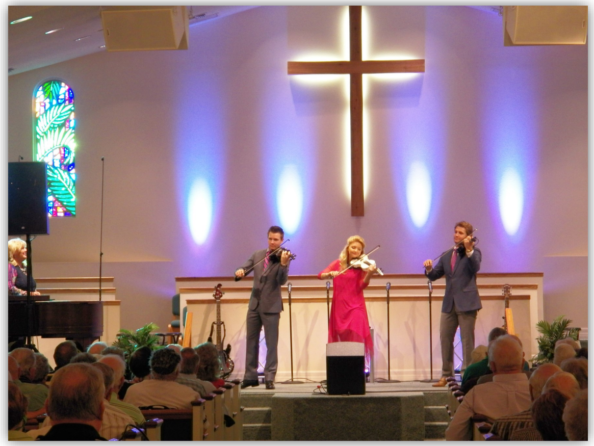
The Brown's in Concert at GOCC (March 8, 2015)