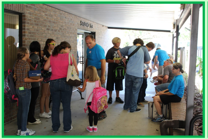
Greeters and Guides